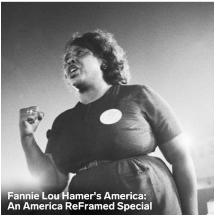
Fannie Lou Hamer's America: An America ReFramed Special